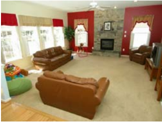
Family Room w/Fireplace