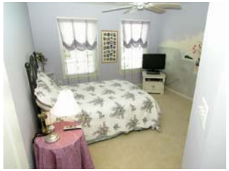
Bedroom w/Ceiling Fan