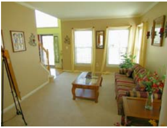
Formal Living Room