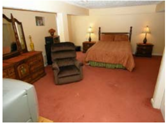
5th BR w/Full Bath