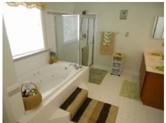
Master Suite Super Bath