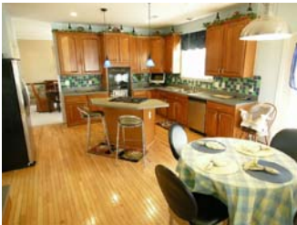
Deluxe Spacious Kitchen