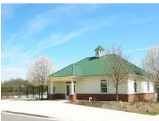
Outdoor Pool/Rec Center