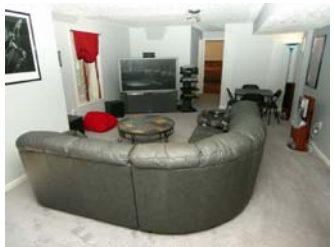
Finished Rec Room