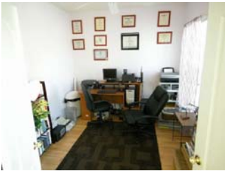
1st Floor Den