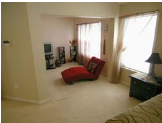
Master Suite Sitting Room